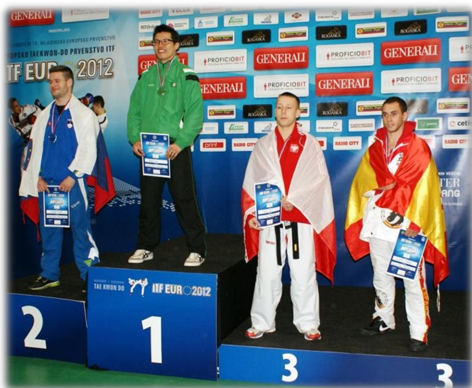
Hong Looi, European Champion 2012

superstitious little things like not getting a haircut before a championship. At this stage it's not actually the physical preparation that makes the difference, it's the mental preparation. That includes little things like I don't look at the draw sheets before the championship. In that way you spend your energy only on that day and do not work yourself up a few days before your fight, and so you are able to train properly and have a set routine.